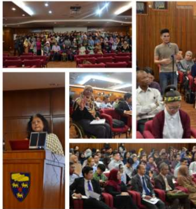
MPP students attending a Public Lecture Series delivered by Professor Dr Sheila Jasanoff, Pforzheimer Professor of Science and Technology, Harvard Kennedy School, United States of America titled Science, Technology And Society: A Field For The 21st Century' (March 2019)

The Master of Public Policy (MPP) students enjoy the benefits of being part of an international institute which does not only run an academic programme but also acts as a hub of policy discourse that attract various stakeholders, policymakers and academicians around the world. As such, INPUMA's programmes and activities often serve as opportunities for students to take part in building their character, leadership and exercise negotiation and critical thinking skills as well as inculcating their sense of belonging and responsibilities.