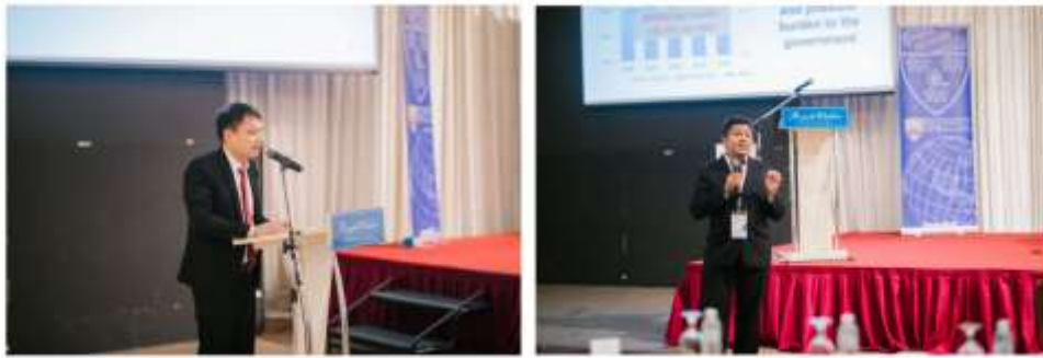
MPP students delivering policy paper presentations at the International Conference on Emerging Issues in Public Policy organized by INPUMA (August 2019)