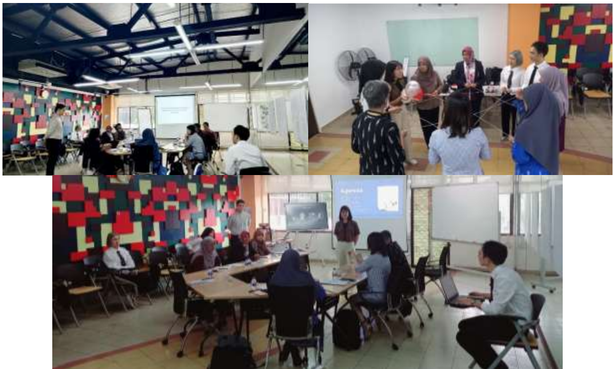
MPP students facilitated series of Policy Lab under an elective course of ZQA7027 (2023)